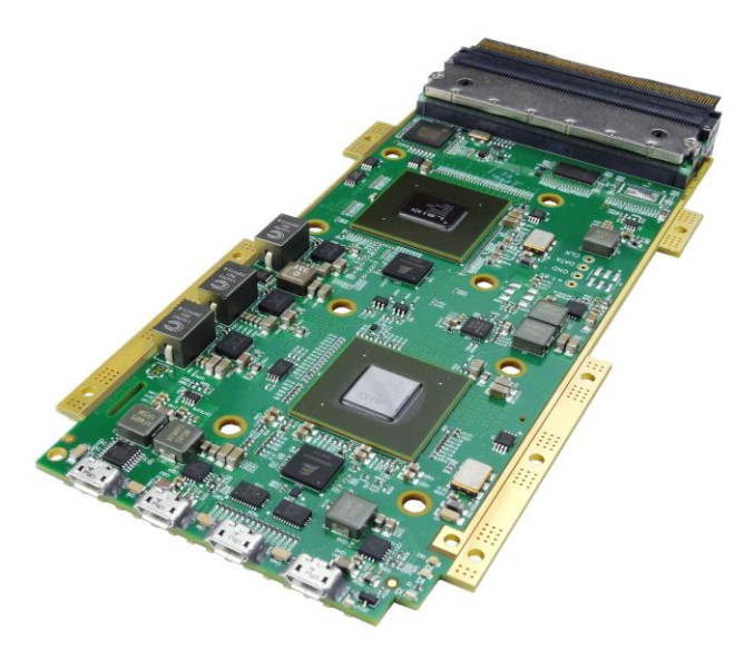
Figure 1: AMC631C

The AMC631C is available in rugged conduction-cooled (MTCA.2 or MTCA.3) versions.